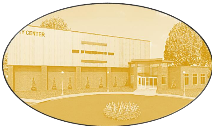
The Doty Center