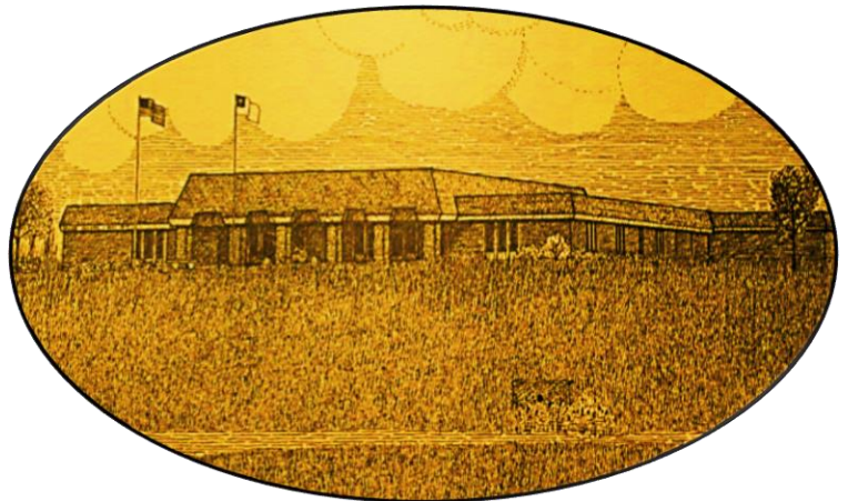
GLCC Administration Building Classrooms, Library, Cafeteria, Student Mall, Offices

* Restoration History requirement will NOT be fulfilled by transfer of an MTA approved associate degree.