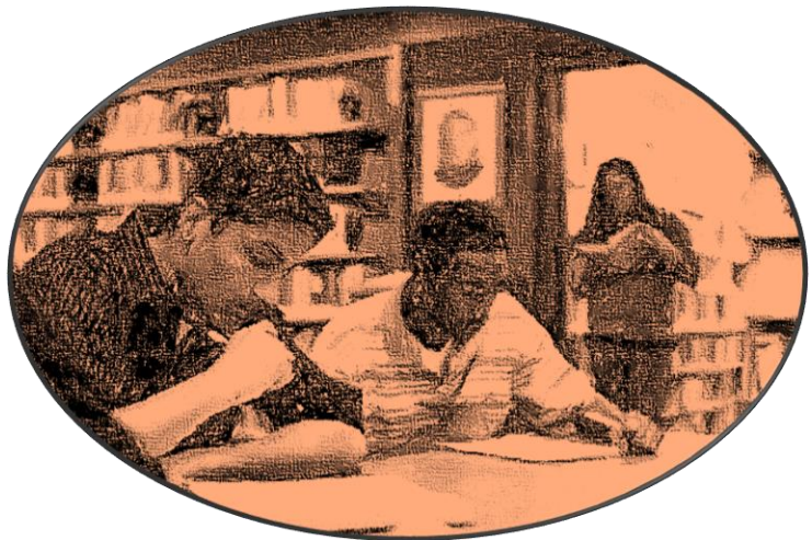
Louis M. Detro Memorial Library