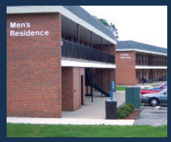
New outdoor identification signs help visitors see the purpose of each building at a glance.