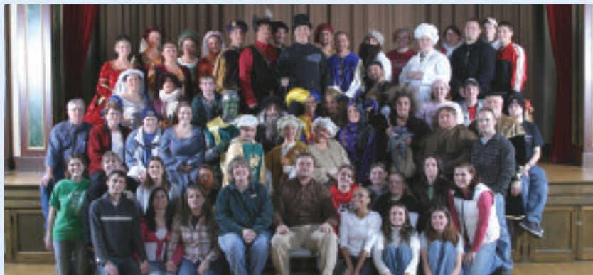
Madrigal Cast: 2005 Madrigal Dinner Theater Cast and Crew

The 2005 Madrigal Dinner and Concert was a big success. Alis Volat Propriis: She Flies with Her Own Wings was performed by a 27 member cast, 27 crew, 13 musicians, and more than 30 servers. A total of 1189 people attended the six performances.