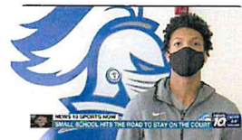
Small school hits the road to stay on the court wix.com