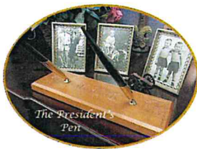
The President's Pen